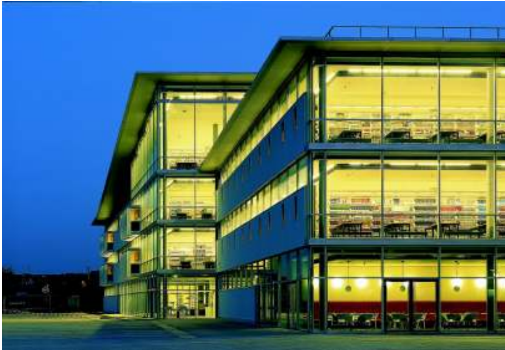
The University of Erfurt's library