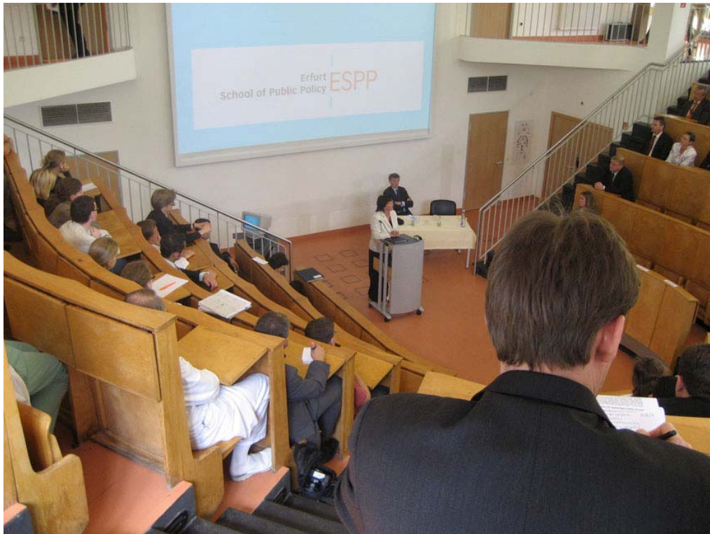
Federal Minister of Health Ulla Schmidt speaking at the ESPP in June 2007