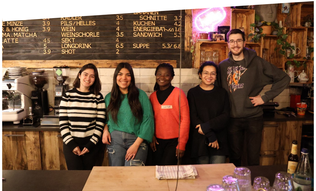
The members of the Student Government during one of their social events for students.

Your student buddy might pick you up via tram from the Erfurt main station and/or pick up your dorm key on your behalf in case you arrive outside of the student dorm administration's office hours, for example. Most importantly, though, your buddy knows exactly what it is like to arrive in a new town, country and academic life – because he or she has been there before – precisely one year before, that is.