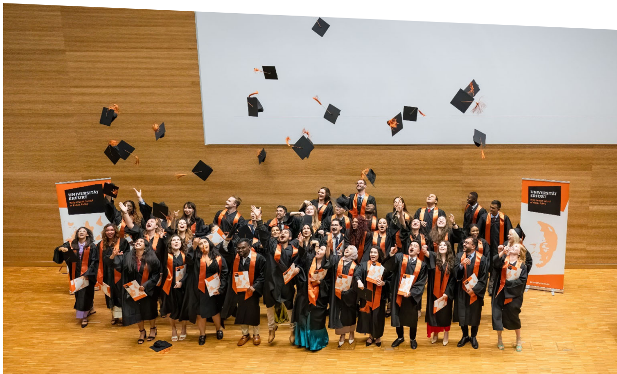
MPP students throwing their hats during the annual Brandt School Farewell Ceremony.

https://www.uni-erfurt.de/en/brandtschool/studies/current-students/student-activities