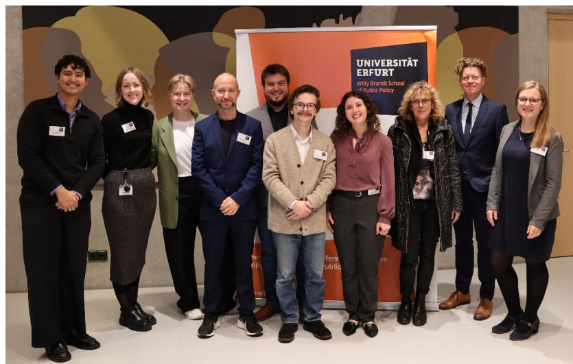
The Brandt School Admin Team during our annual Welcome Reception for new students.

The Brandt School Team is made up of faculty (professors, doctoral students, etc.) and administrative staff who work closely together to make sure you have the best experience during your master's studies.