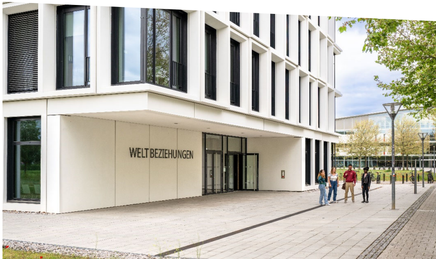
The Research Building "World Relations – Weltbeziehungen": home of the Brandt School.

The Willy Brandt School of Public Policy is where ambition meets impact. As Germany's pioneering public policy school, it brings together a diverse and driven community from across the globe, united by a passion for tackling today's most pressing challenges. Named after Nobel Peace Prize laureate and visionary leader Willy Brandt, the school embodies his legacy of bold ideas, international collaboration, and transformative change. The Brandt School prepares future leaders to shape policies that matter—whether in government, international organizations, or the private sector. This is where global perspectives ignite innovative solutions. Welcome to the forefront of public policy!