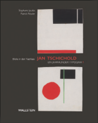
(Göttingen: Wallstein, 2019).

Born in Leipzig in 1902, Tschichold became one of the major protagonists of what is known today as the "New Typography", but later in his life he promoted a more traditionalist approach to book and type design. Tschichold is still considered the most important typeface artist of the 20th century, whose designs and publications influenced generations of designers, letterpress printers, and typographers. The digitized collection includes substantial parts of his working estate; highlights are reproduced and commented in the volume Jan Tschichold – ein Jahrhundert-typograf?